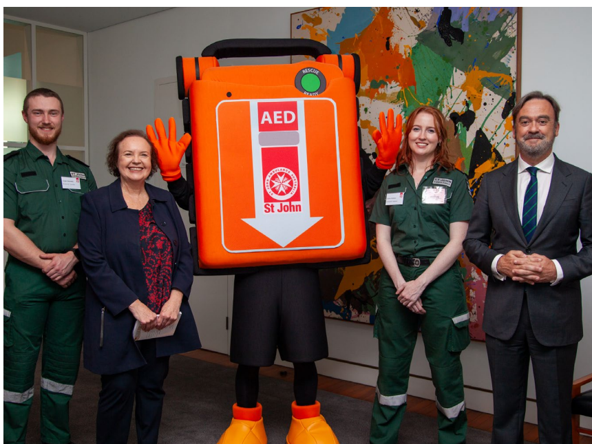
Senator the Hon Carol Brown and Senator Andrew McLachlan CSC with the St John Defib crew at the launch of the Parliamentary Friends group in August.

Mrs Melissa McIntosh MP Senator Andrew McLachlan CSC Ms Alicia Payne MP Senator Louise Pratt Mr Dan Repacholi MP Ms Rebekha Sharkie MP Mr David Smith MP Senator Tammy Tyrrell Mr Bert van Manen MP Ms Jenny Ware MP Dr Anne Webster MP