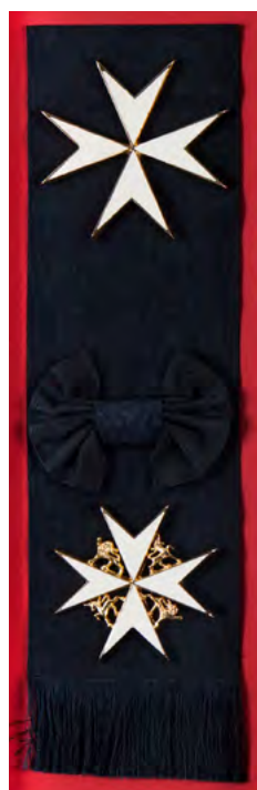
The Baliff Grand Cross