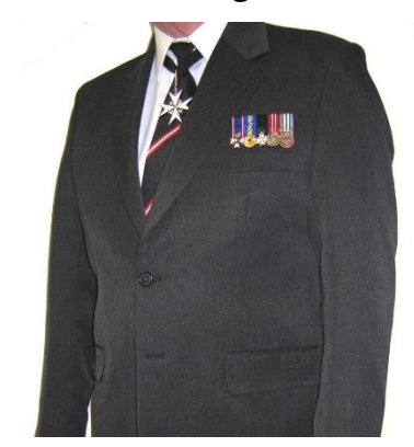
Example of wearing a row of miniatures with a neck badge.

Members of the Order of the grades of Commander and above who have miniature medal bars may wear both the miniature of their grade on the miniature medal bar and the full-size insignia.