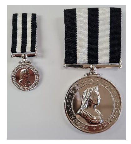
Miniature on left and full size medal on right

Where a member has more than one award, miniature medals can be mounted on a miniature bar. Therefore, members are able to display the full range of their awards. They are placed on the miniature bar in accordance with the Order of Precedence with the highest award worn closest to the centre of the chest. For example, if a member is both a member of the Order of St John and has a St John long service medal,