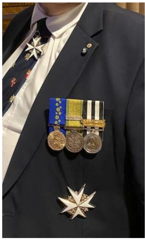
Example of wearing of neck badge, star and three medals (Order of Australia Medal, National Emergency Medal and St John long service medal)

Breast Stars for male and female members of the Order, holding the grade of KStJ/DStJ and above, are worn on the left side centrally below the breast pocket (or where a pocket might be). A star is normally worn together with a single neck badge.