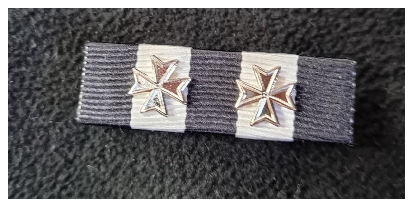
Ribbon with two crosses.

A ribbon or ribbon bar is worn on the left breast.