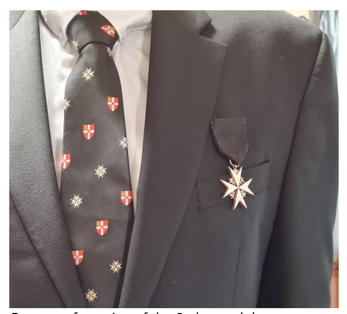
Exampe of wearing of the Order medal.

When promoted to CStJ or higher, the full-size Order medal is removed from the row of medals.